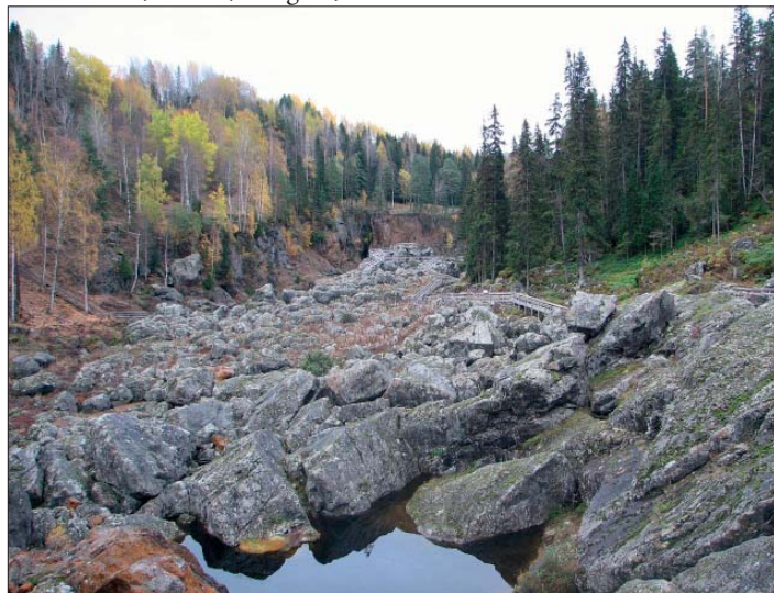
The Dead Falls.

THE DEAD FALLS – Nature reserve with an exciting and interesting story. During the night of 6–7 June 1796 Lake Ragundasjön was emptied and disappeared in 4 hours. The 35 meter high waterfall dried out and fell silent for ever – and became "The Dead Falls". More information: www.dodafallet.nu GPS: Lat 63,055154, Long 16,519182